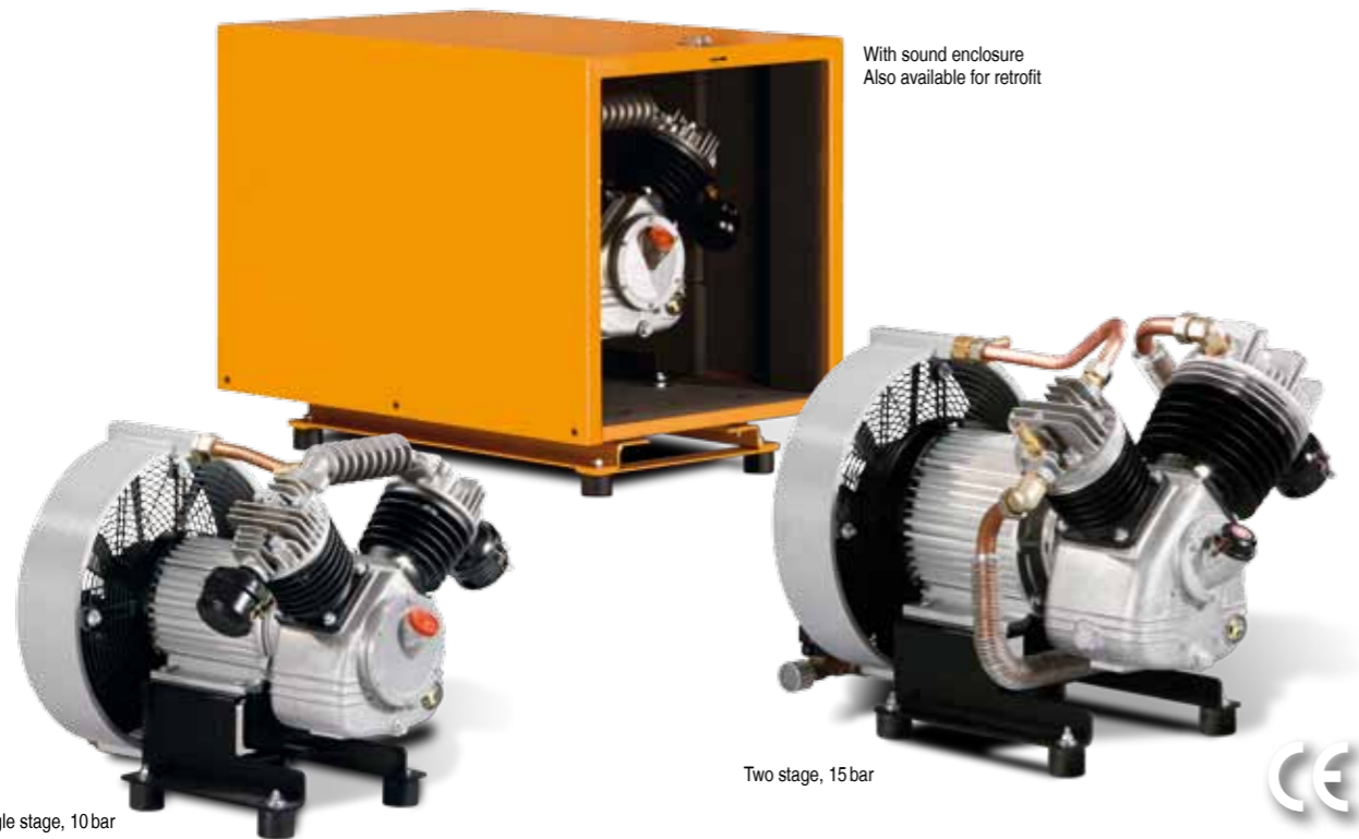
With sound enclosure Also available for retrofit